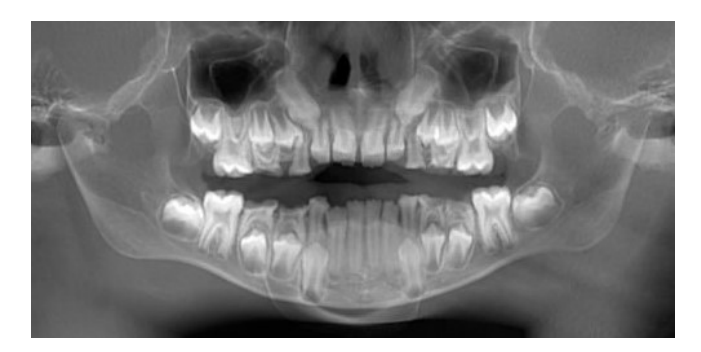
Figure 1. OPG of a pediatric patient that was obtained from raw CBCT image.

All CBCT images of the patients were processed and OPGs were created with an image program (NNT Software V3.00; New-Tom; Italy) (Figure 1-2).